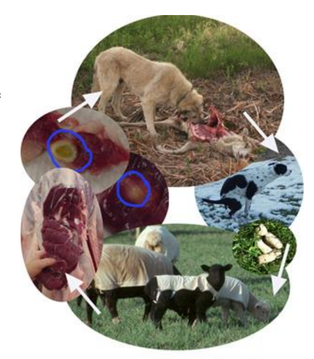
Figure 3: Ovine Cysticercosis life cycle.

Cysticercosis is transmitted to sheep eating forages contaminated with tapeworm eggs shed by dogs and coyotes via their feces. The infective larvae penetrate the intestinal wall and are transported by blood to the heart and muscles. It takes about 56 days for the cysts to develop in the sheep and about 7 weeks for the tapeworm to develop in the dog. In the case of muscular cysticercosis, the larvae form cysts in the heart, diaphragm, masseter (cheek) and other muscles.