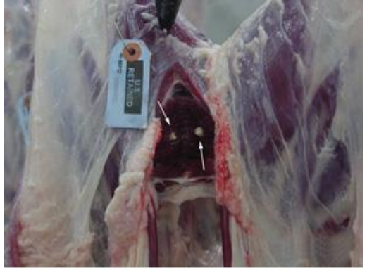
Figure 1: Condemned carcass due to Cysticercosis ovis found in the leg muscles.

Muscular Cysticercosis, or "measles" in sheep, is characterized by the development of cysts, often degenerated, in skeletal muscle, heart muscle, and the diaphragm (see Figure 1 and Figure 2). Cysts are first grossly visible about two weeks after infection as a pale, semi-transparent spot about 1.0 mm in diameter. Cysts reach maturity in about 12 weeks and are white in color and about 1.0 cm. These cysts may later calcify.