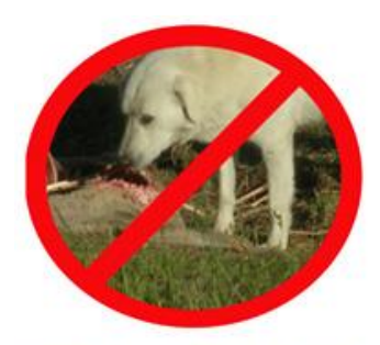
Figure 4: DO NOT ALLOW dogs to feed on sheep carcasses.